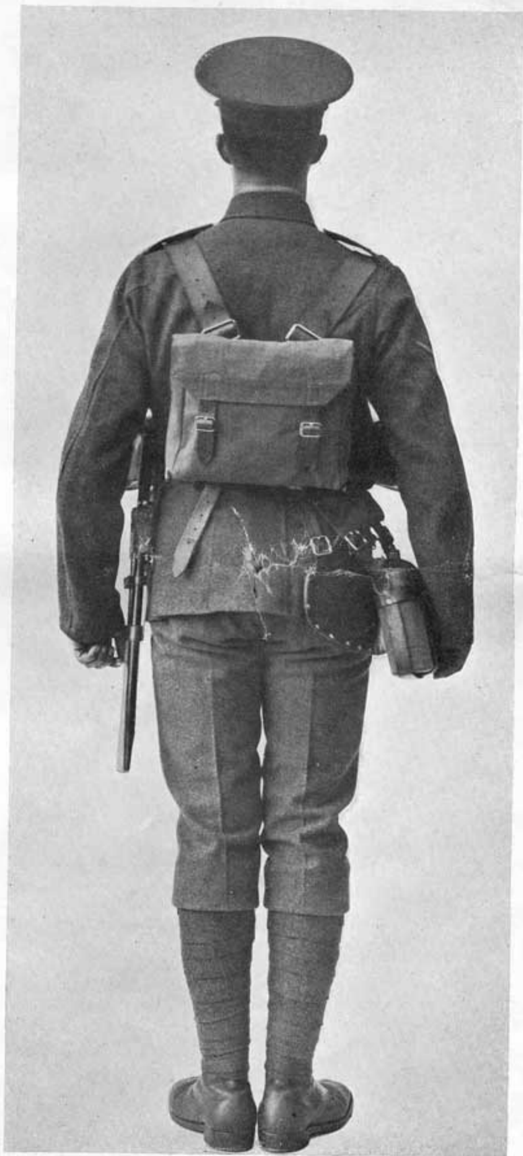
EQUIPMENT WITHOUT PACK, SHOWING CARRIAGE OF HAVERSACK.