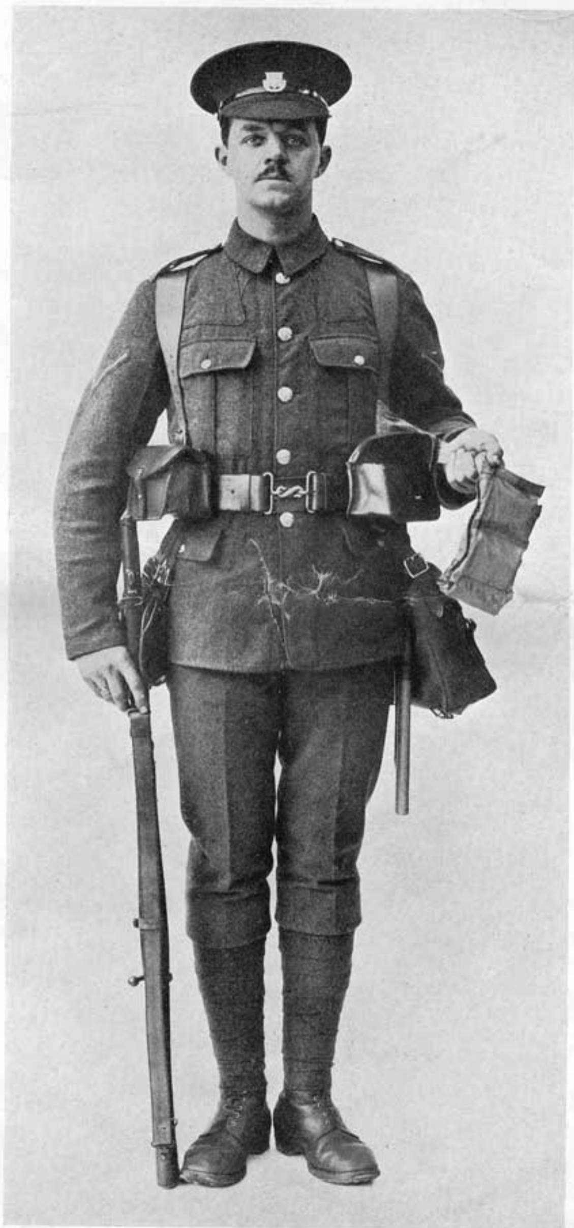
COMPLETE EQUIPMENT, FRONT VIEW, SHOWING COTTON BANDOLIER CONTAINING 50 ROUNDS OF S.A. AMMUNITION.