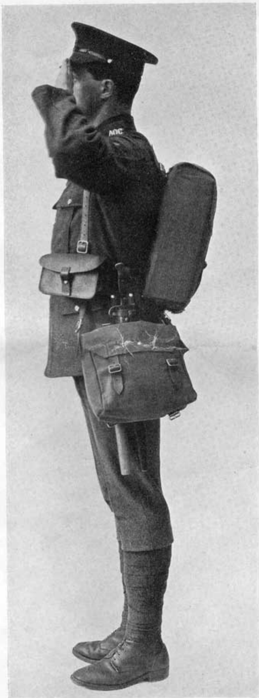
COMPLETE EQUIPMENT. SIDE VIEW.