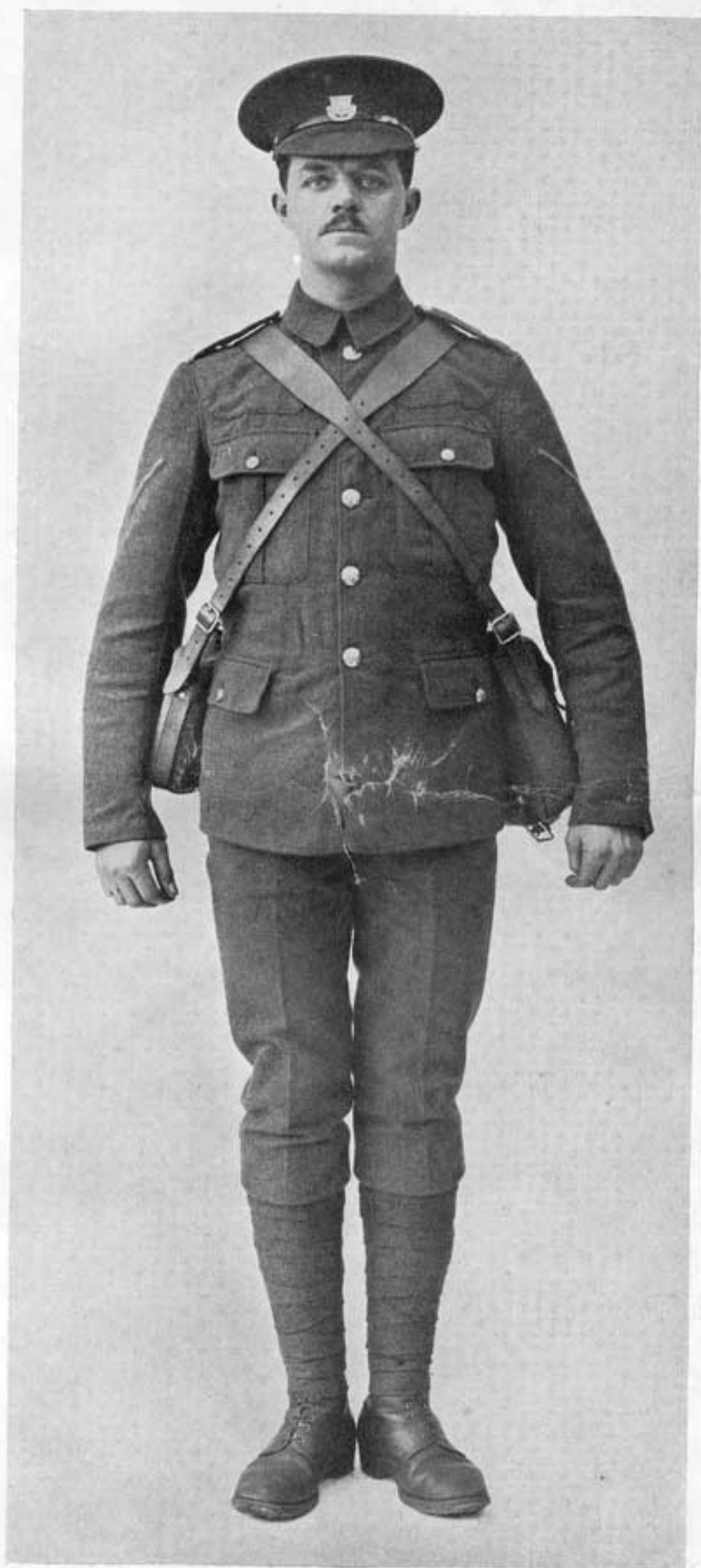
BRACES SEPARATED FROM EQUIPMENT AND ATTACHED TO WATERBOTTLE AND HAVERSACK, SHOWING ORDINARY METHOD OF SLINGING ACROSS THE SHOULDERS.