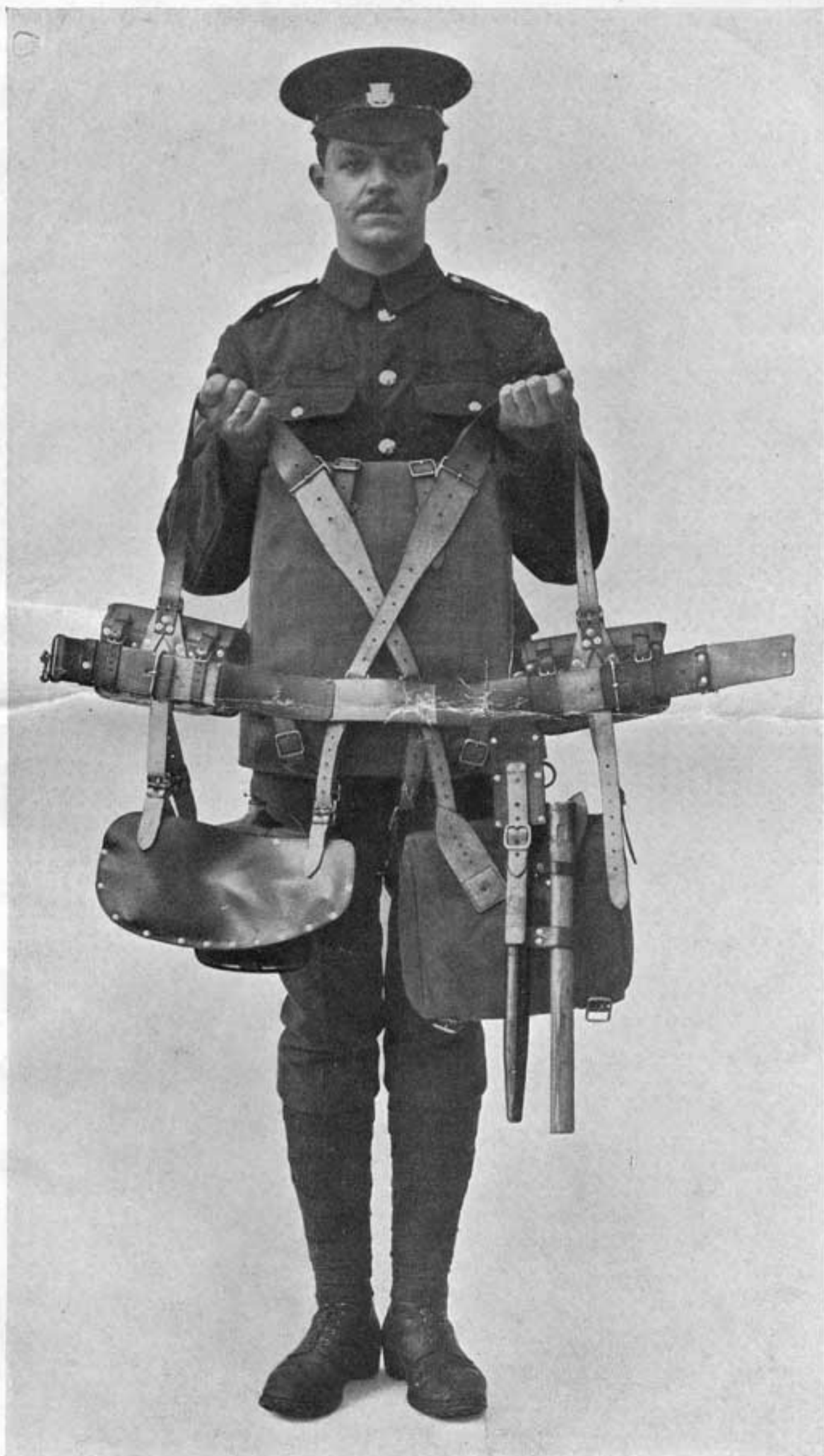
COMPLETE EQUIPMENT ASSEMBLED.