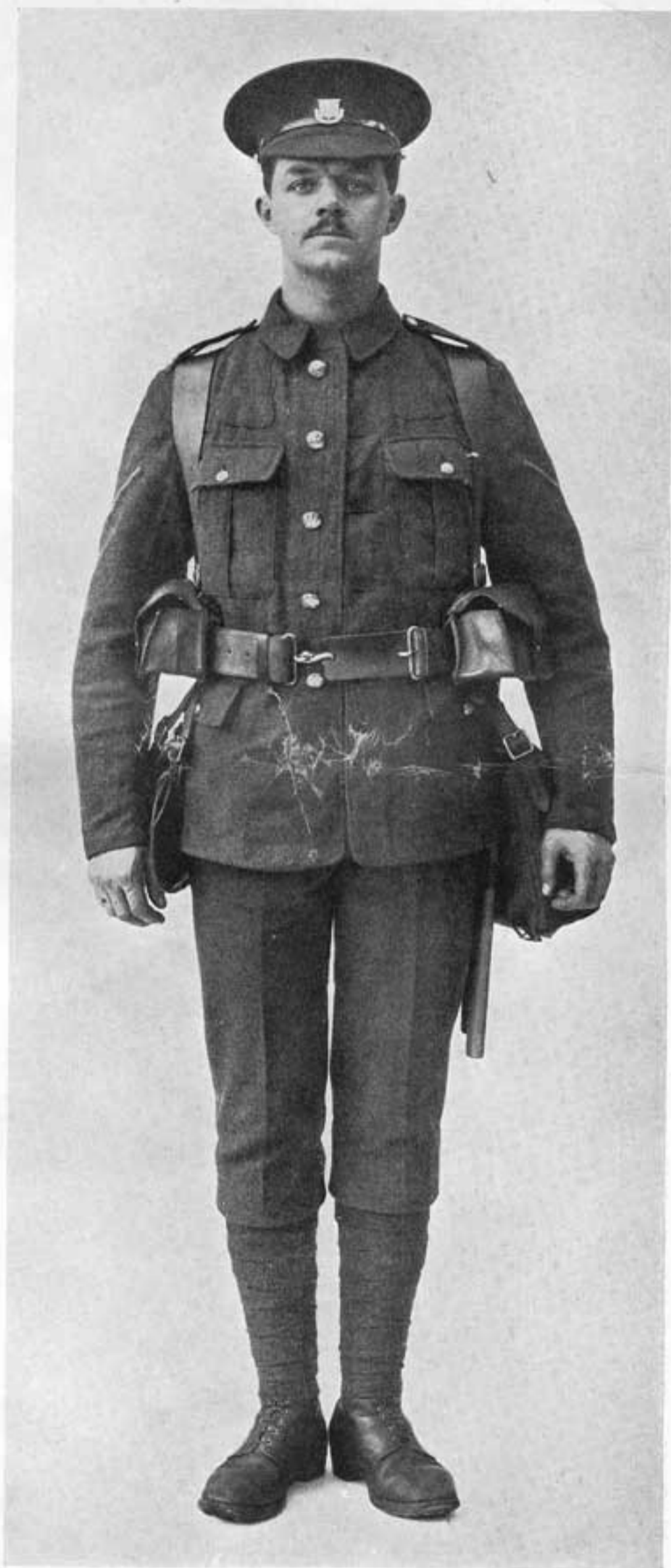
COMPLETE EQUIPMENT, SHOWING EXTENSION OF WAIST BELT.