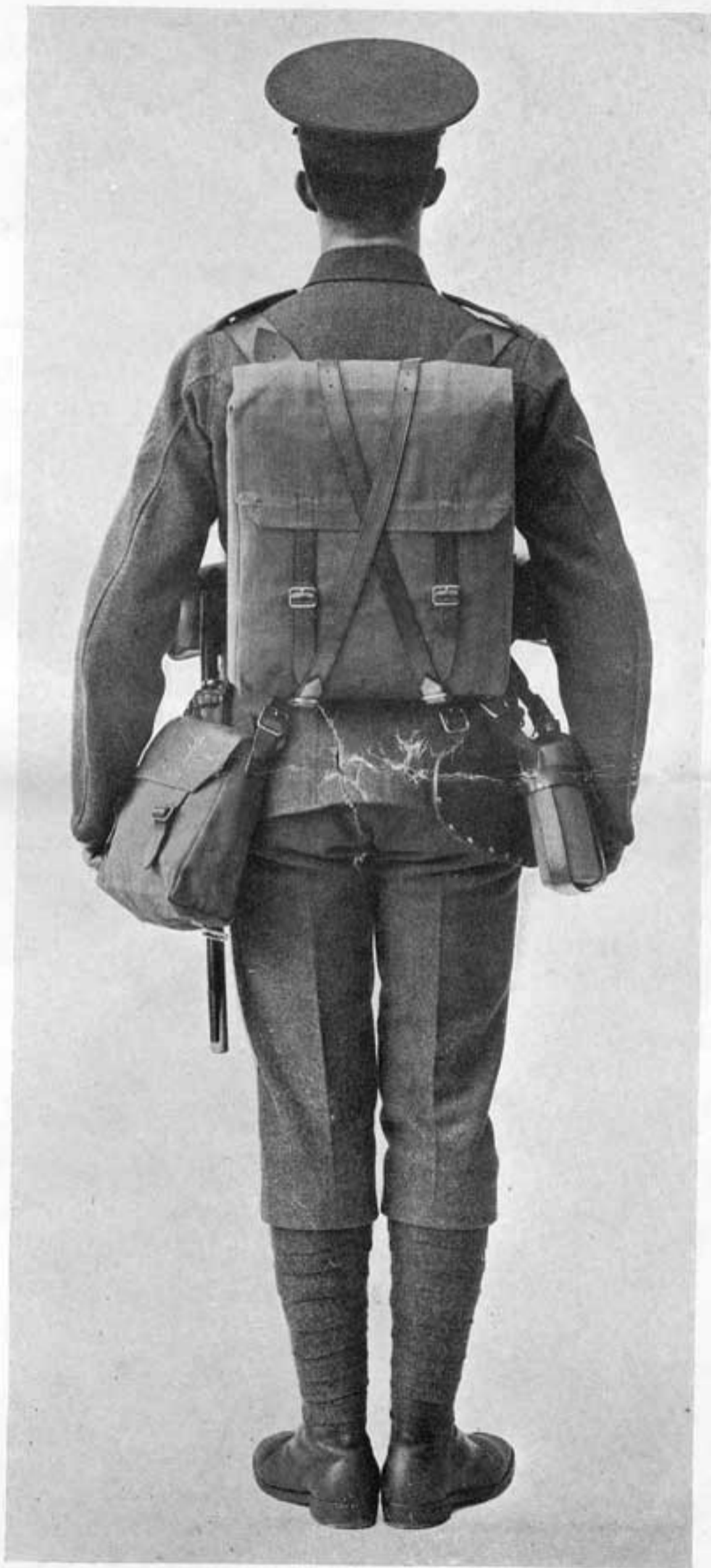
COMPLETE EQUIPMENT. BACK VIEW.