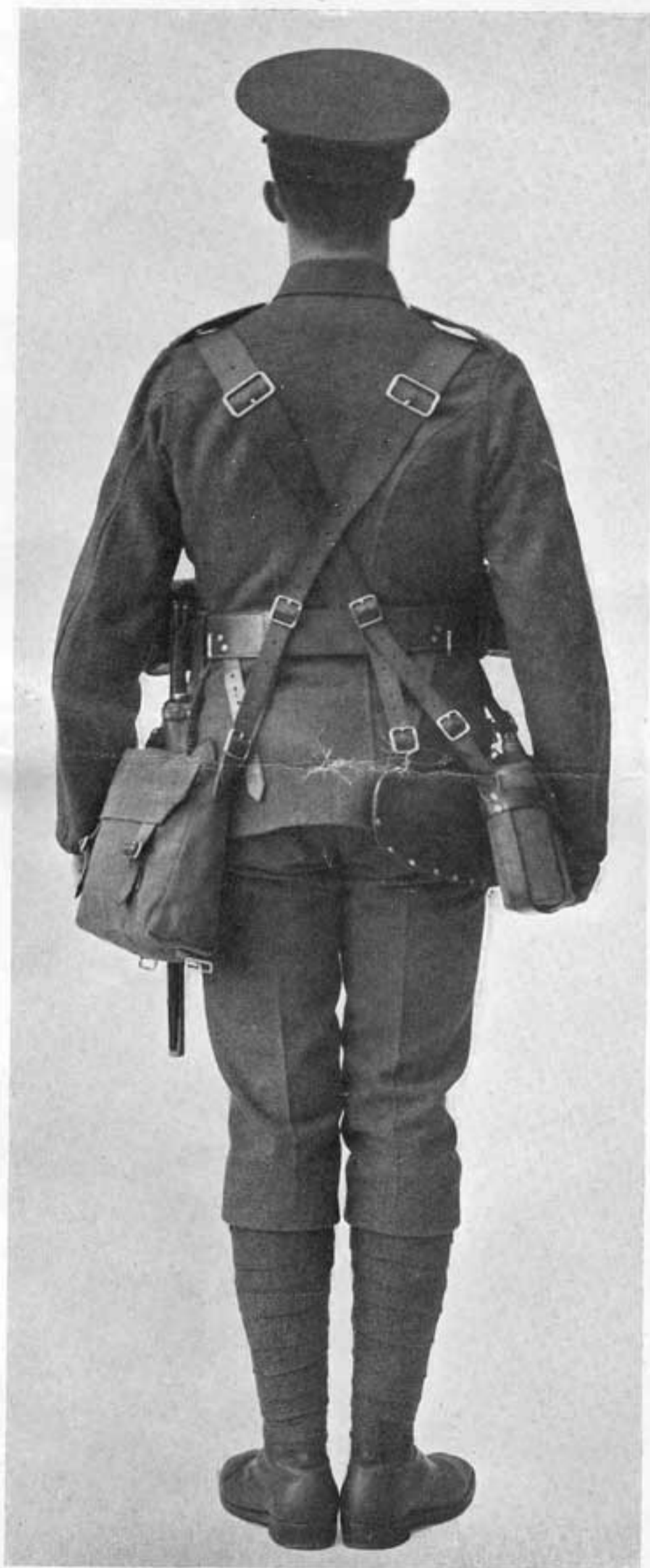
MARCHING ORDER EQUIPMENT, WITHOUT PACK.