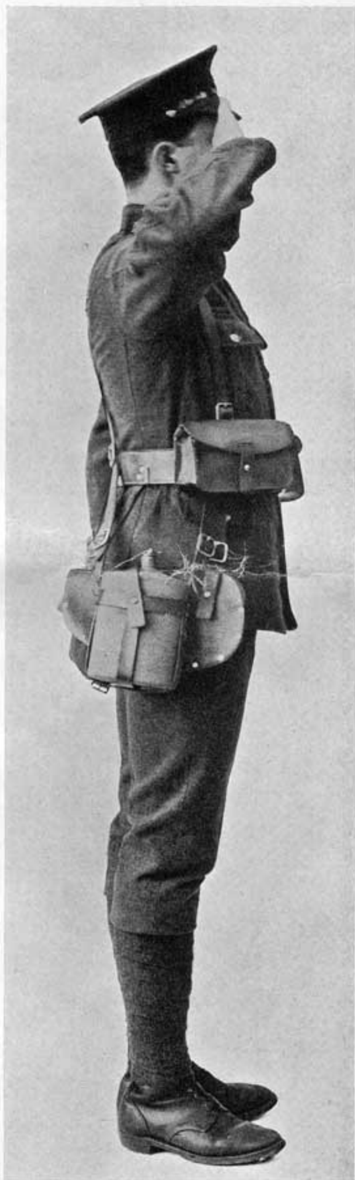
MARCHING ORDER EQUIPMENT, WITHOUT PACK.