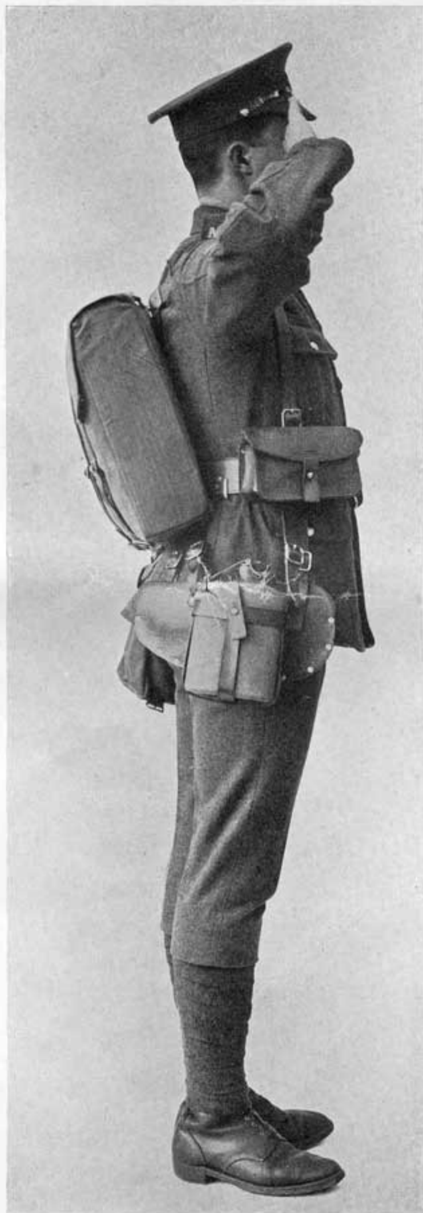
COMPLETE EQUIPMENT. SIDE VIEW.