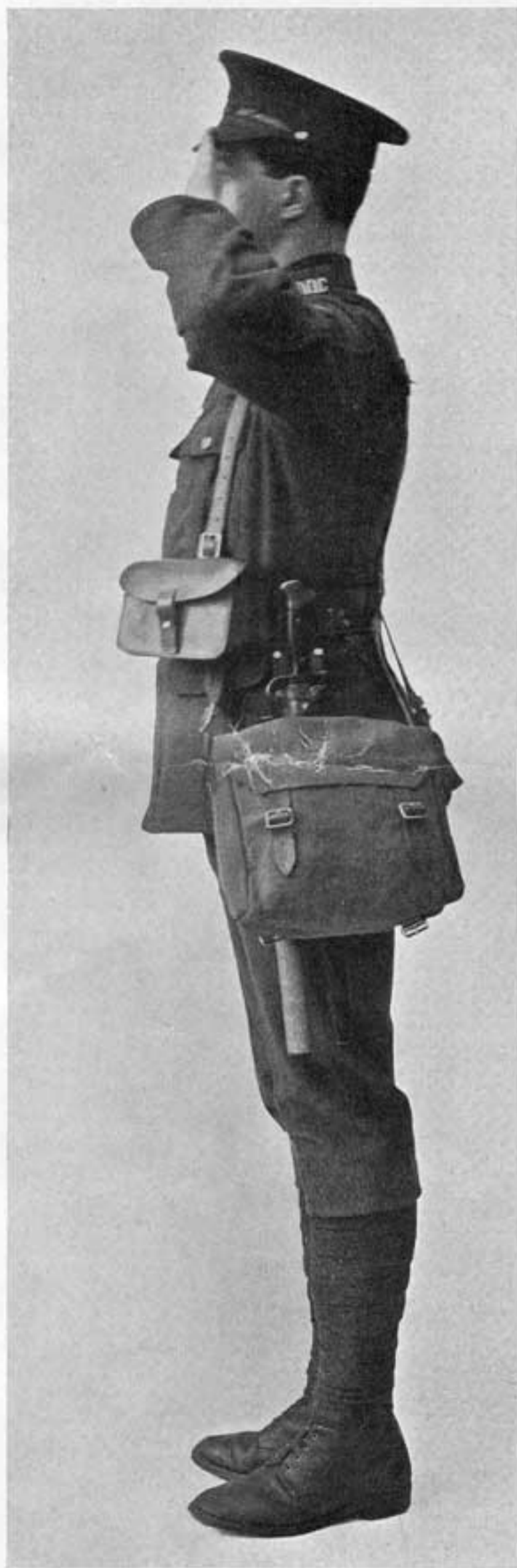
MARCHING ORDER EQUIPMENT, WITHOUT PACK.