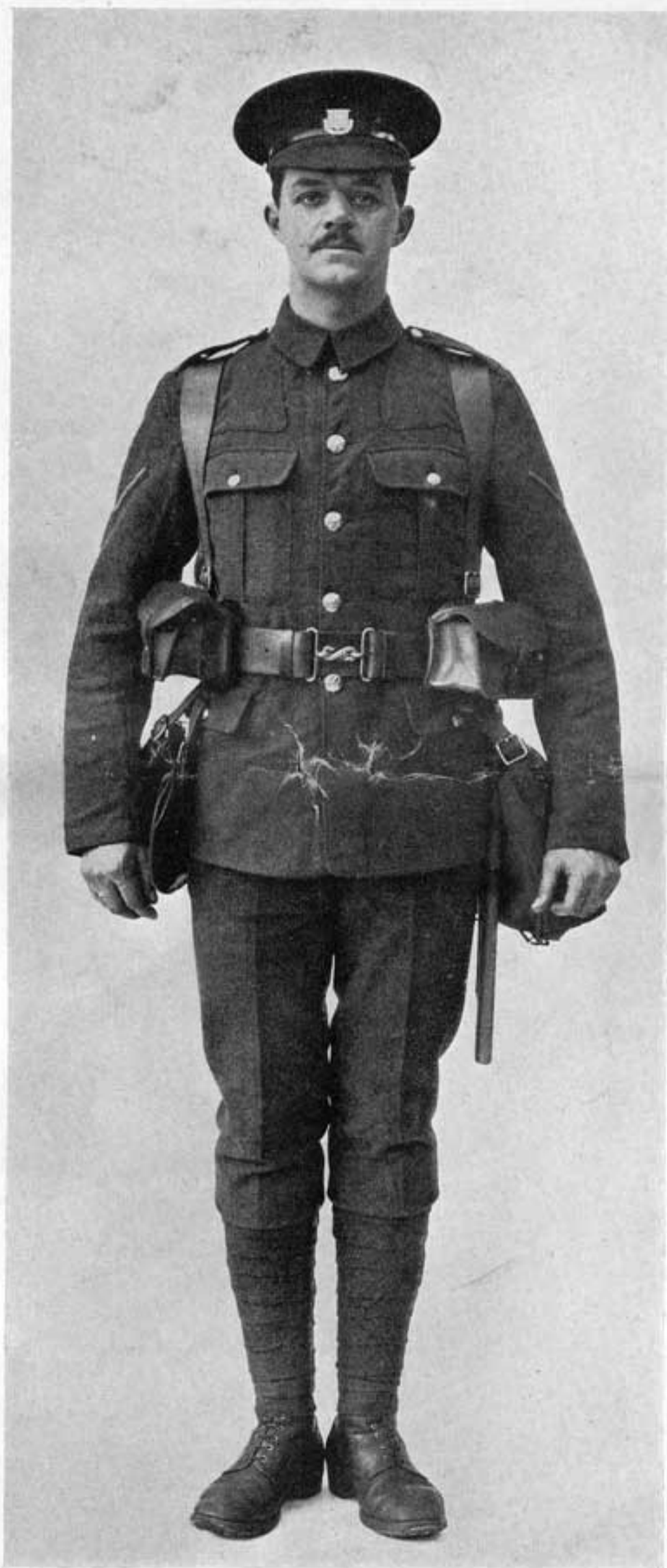
COMPLETE EQUIPMENT. FRONT VIEW.