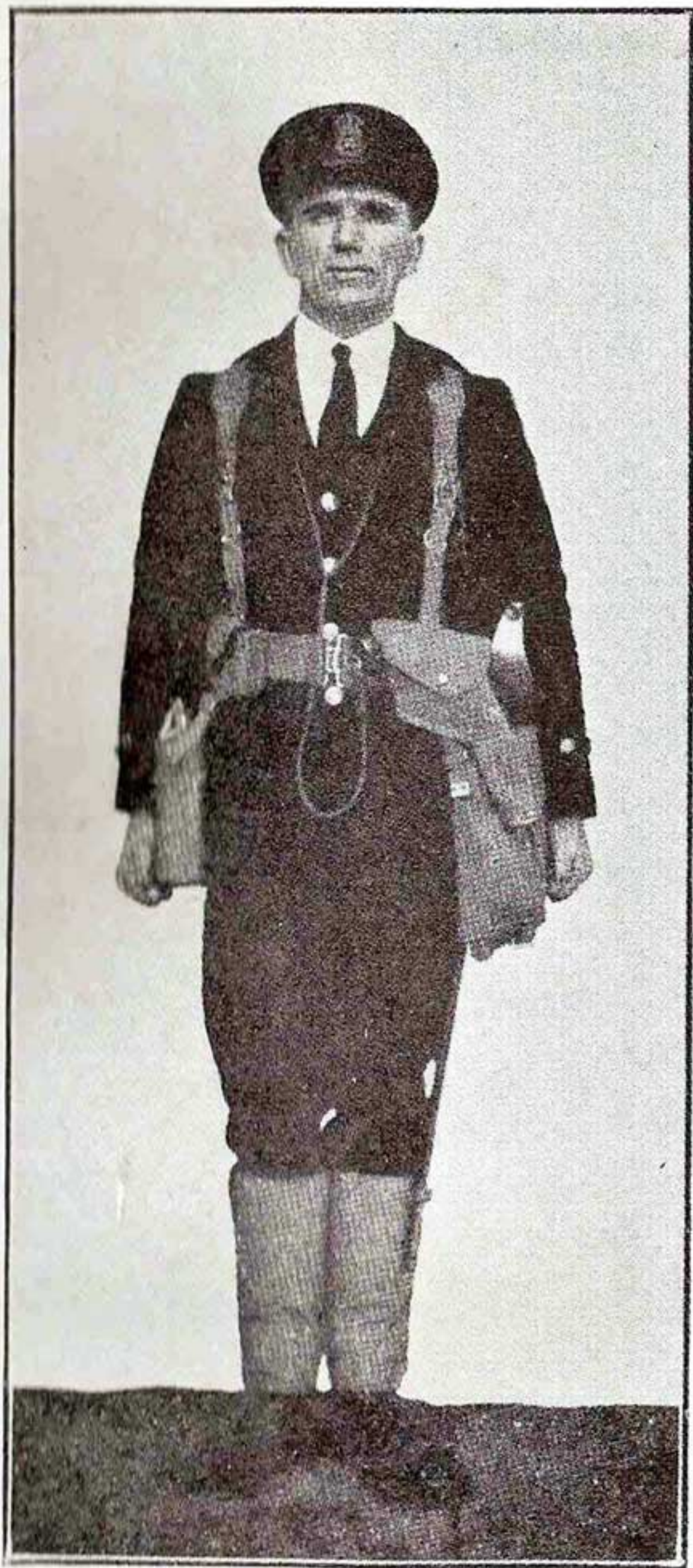
Pistol Equipment—Front View.