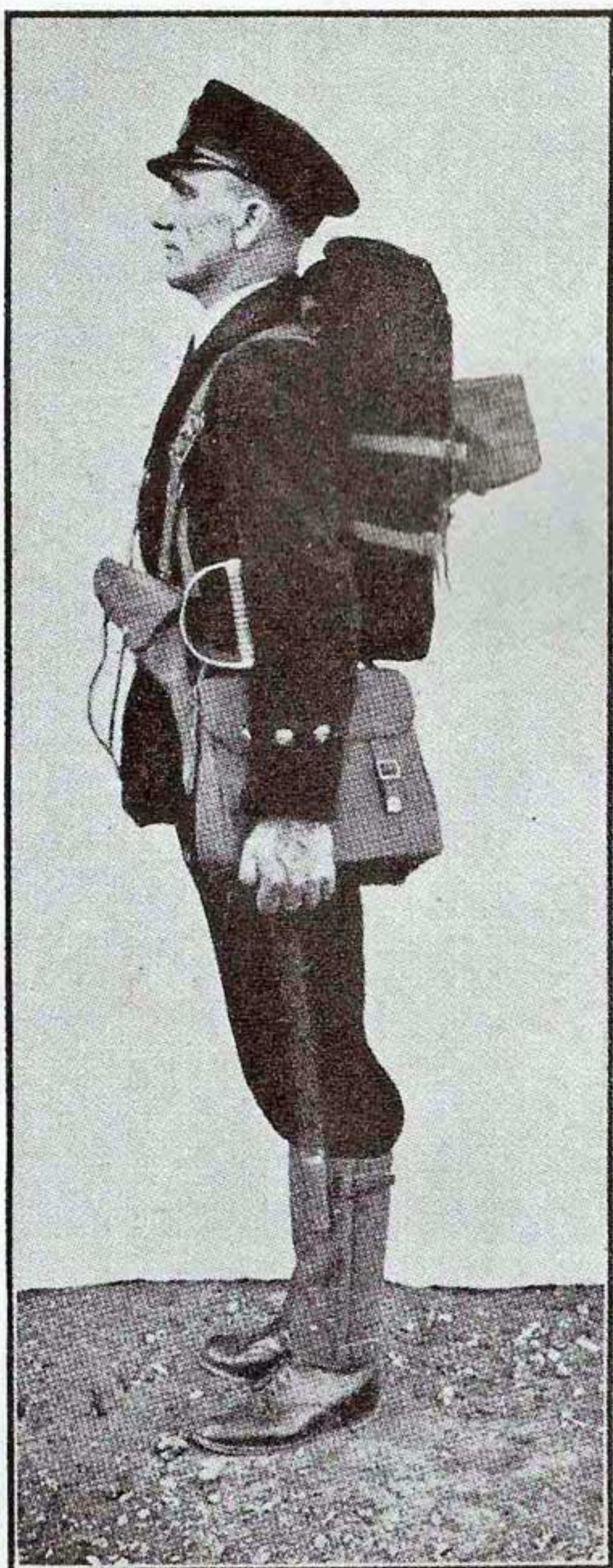
Pistol Equipment—Side View.