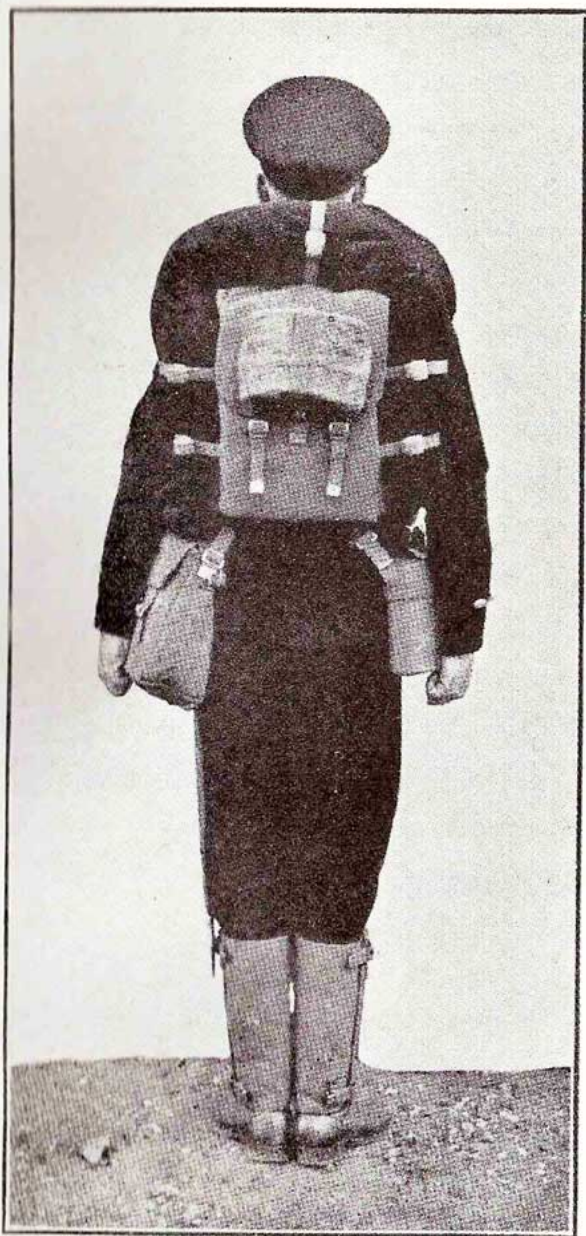
Pistol Equipment—Back View.